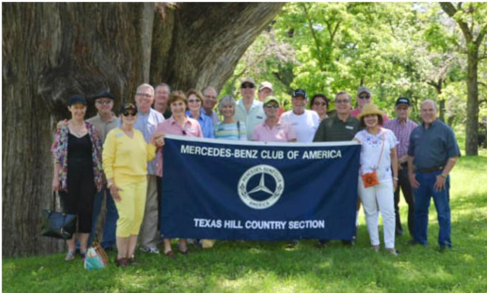
Group Photo in front of the 860 year old Cypress Tree.

Utopia on the River – is a Bed and Breakfast spot located in the Texas Hill Country next to the banks of the Sabinal River. Mercedes group is standing beneath the 3 rd largest Bald Cypress tree in Texas. Measuring 29 feet around, it is roughly 860 years old. Our group had lunch in the dining room of the lodge.