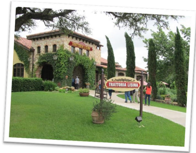
Trattoria Lisina Italian Restaurant.

After visiting the Market Days vendors, we were off to Driftwood for lunch at Trattoria Lisina Italian Restaurant located next to the Dutchman Winery.