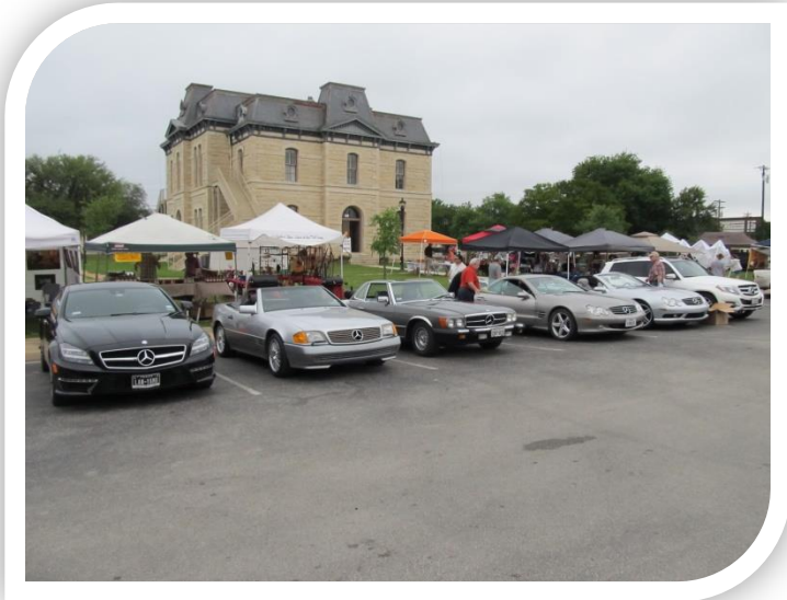
Blanco Texas – Market Days. We parked in front of the Old Country Court House.

We parked in front of the Historic County Court house in Blanco and displayed our cars.