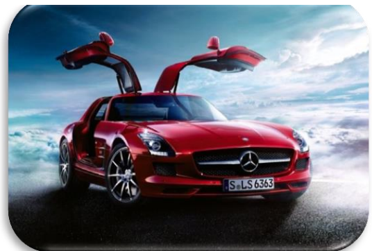
2011 Mercedes SLS AMG